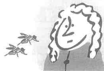
Beauty and the Bees

"Beauty is in the eye of the beholder." This famous saying means that people often disagree about what is beautiful. Is there something you find beautiful that others seem to behold with less admiration? On your own paper, write a paragraph about it, using at least THREE Words . Explain why it pleases you and why you think others may disagree with you.