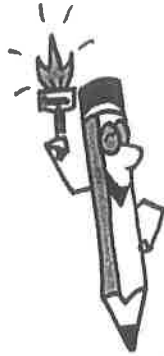
I love that lady from France.

5. Label each sentence as complete, fragment, or run-on.