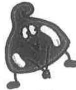
Call me Chip.