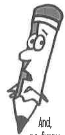
And, no funny nose jokes.