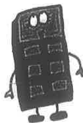
I'm so sweet.