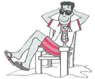
Sweltering and sluggish but jovial