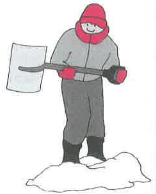
Not sweltering, not sluggish, and not jovial at all