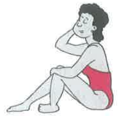
Sweltering and sluggish