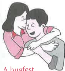
A hugfest (the opposite of a slugfest)