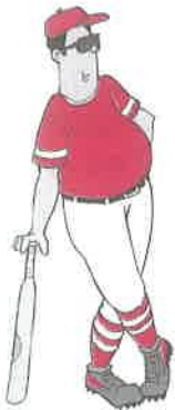
A nonchalant slugger