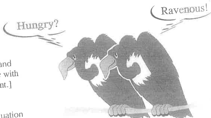
A Terse Conversation

vessel VES•ul NOUN 1. a hollow container such as a cup or vase [The crystal glass was the perfect vessel for the deep red cranberry juice.] 2. a ship or boat [My uncle knows every vessel that ever anchored in that harbor.]