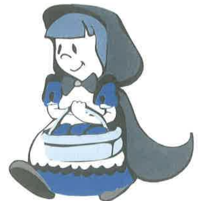
The genial girl in acute danger from the menace in a quaint disguise