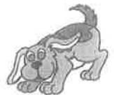
Adapting to being omitted