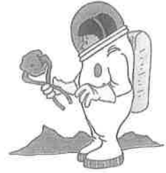
Adapting to a new place