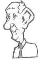
Adapting to getting older