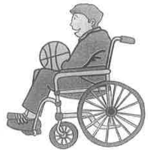
Adapting to new rules