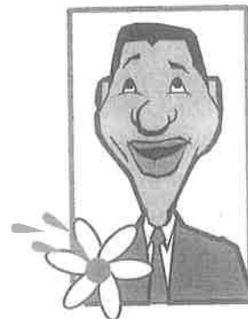
Answer: A hoax that soaks folks

Question: What do you call it when some joker with a fake flower squirts water in people's faces?