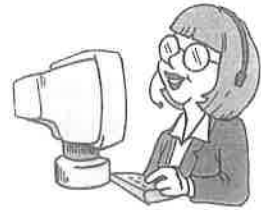
Adapting to technology