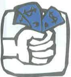
What'll Dudley do when his dollars all have dwindled down the drain?