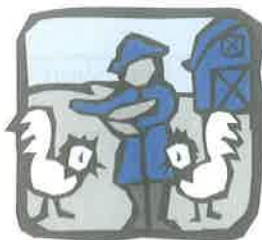
Hansel had to sell all her chickens. Hence Hansel hasn't any hens anymore.