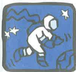
Hugh once floated high over Earth. Now Hugh hovers happily in Heaven.