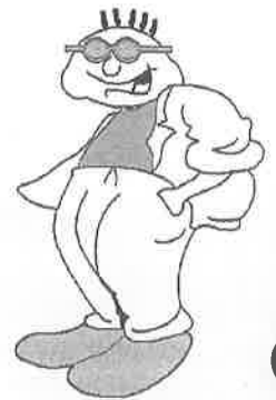
A guy with an insufficient supply of hair