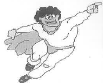
A super guy who never cowers